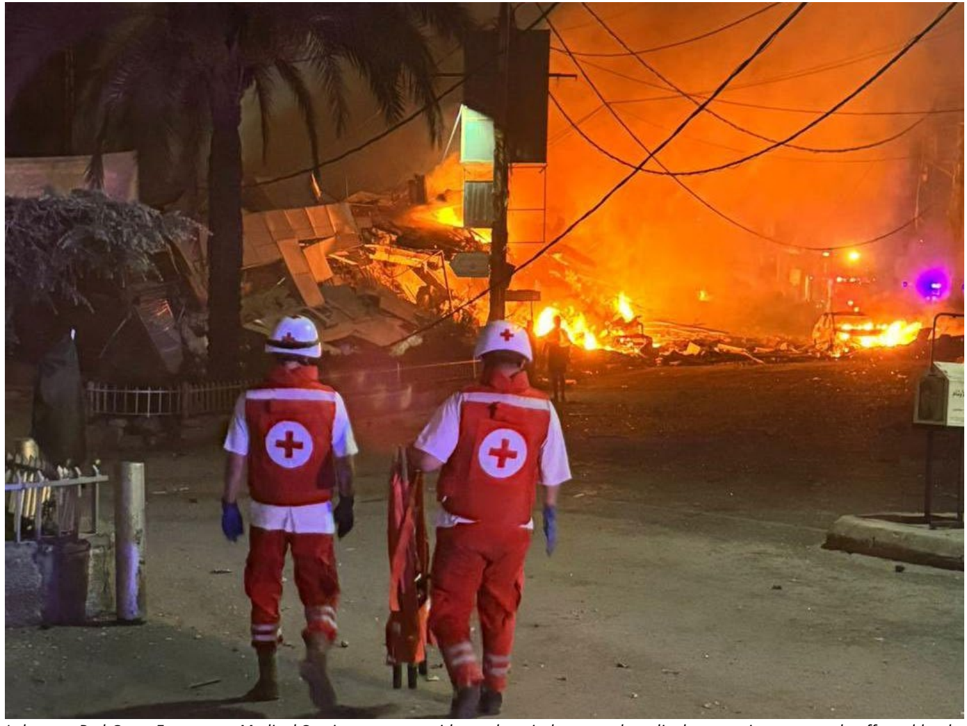
Lebanese Red Cross Emergency Medical Service teams provide pre-hospital care and medical evacuations to people affected by the conflict.