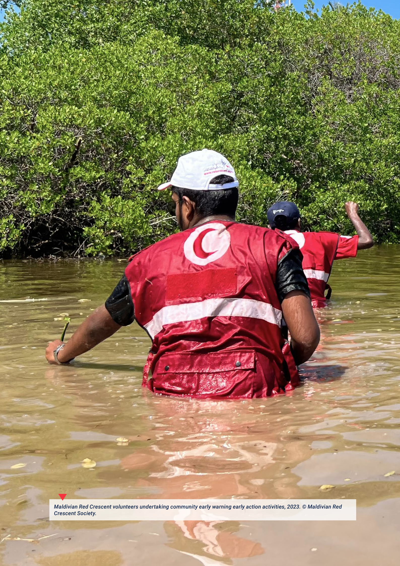
Maldivian Red Crescent volunteers undertaking community early warning early action activities, 2023.