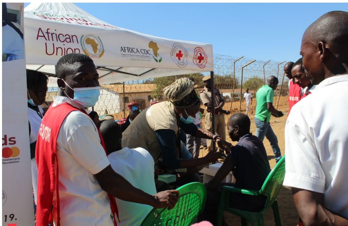
The Malawi Red Cross has continued to reach at-risk groups with vaccines. A prisoner receiving a COVID-19 vaccination at Maula Prison, during a two-day mobilization and vaccination campaign, June 2023, Lilongwe, Malawi.

In 2024, the Initiative will implement a second phase of the programme, and the IFRC will continue to support its member National Societies, as auxiliaries to public health authorities. Importantly, the IFRC, with its member African National Societies, is continuing its partnership with the Africa CDC for the implementation of the new Resilient and Empowered Africa Community Health (REACH) programme, supporting the building of a robust workforce of community health workers capable of responding to future pandemics. The ambition is that five million community health workers will be active across Africa over five years (2022–2026), to improve the reach, impact and efficacy of health services.