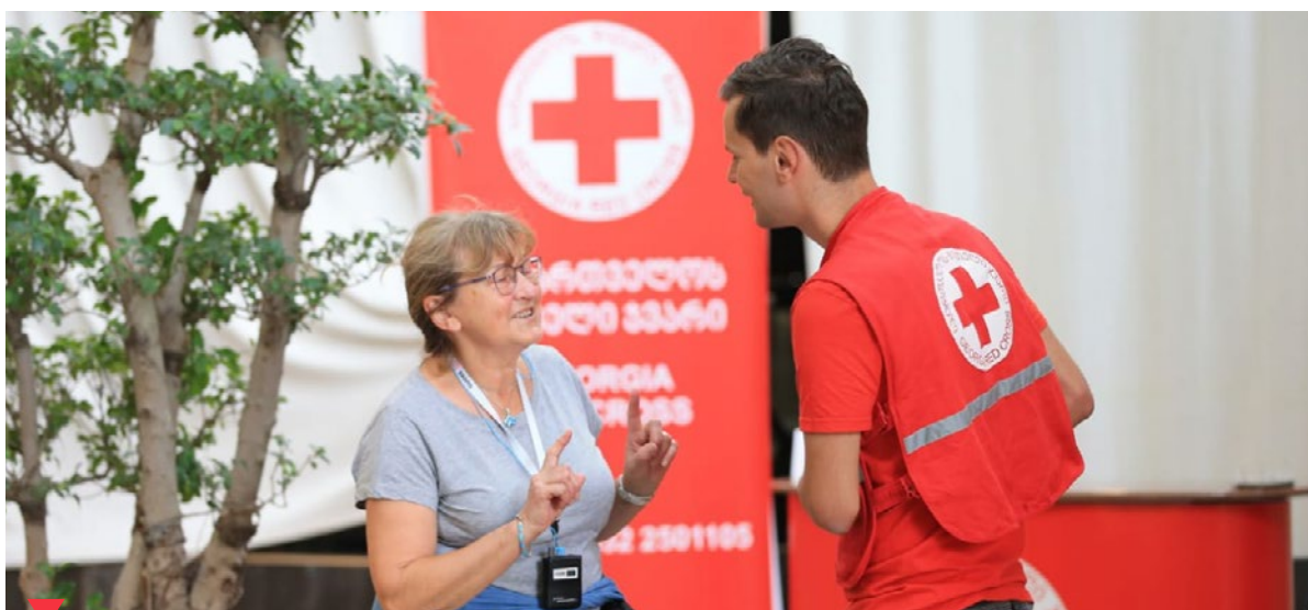
The Georgian Red Cross face to face fundraising activities.

The IFRC provides support such as market research and fundraising audits; developing fundraising strategies and securing seed funding; recruiting, developing and upskilling fundraising teams; offering comprehensive