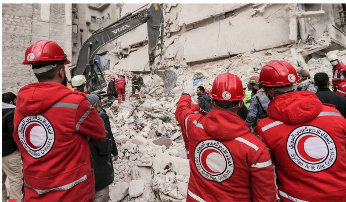
Syrian Arab Red Crescent earthquake response, February 2023.

The Syrian Arab Red Crescent is the largest community-based provider of humanitarian services in Syria, with a network of branches in all 14 governorates, more than 6,000 staff and some 9,300 active and committed volunteers. It has the responsibility to coordinate humanitarian aid in Syria. In partnership with the IFRC, ICRC, National Societies, UN agencies and international and local non-governmental organizations present in Syria, Syrian Arab Red Crescent's volunteers and staff support millions of people each year, playing a pivotal role in delivering vital assistance. In 2023, the Syrian Arab Red Crescent provided principled and comprehensive humanitarian assistance to five million people.