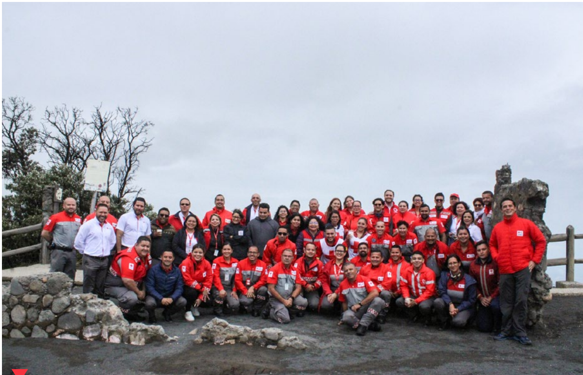
Costa Rican Red Cross volunteers at the Poás Volcano Project, during the OCAC peer review evaluation, September 2023.